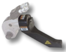
TWHC-ERA Extended Reaction Arm