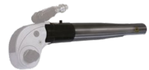
TWHC-LRA Long Reaction Arm