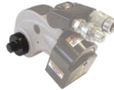
TWHC Hex Drives