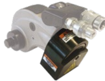
TWHC-RP Reaction Pad