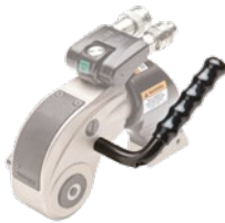
TWHC Handle TWHC1, TWHC3: DFTAS000001 TWHC6, TWHC11: DFTAS000002